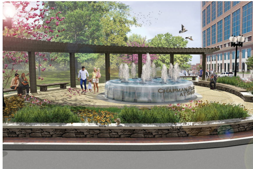
Rendering of Chapman Plaza Project.

these enhancements to help ensure that our park will be enjoyed for years to come by future generations of Clayton residents and visitors.