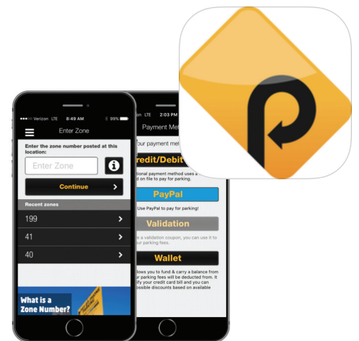
User-friendly Passport Parking Application

For more information on the changes to parking and how parking will improve, visit www.claytonmo.gov/parking .