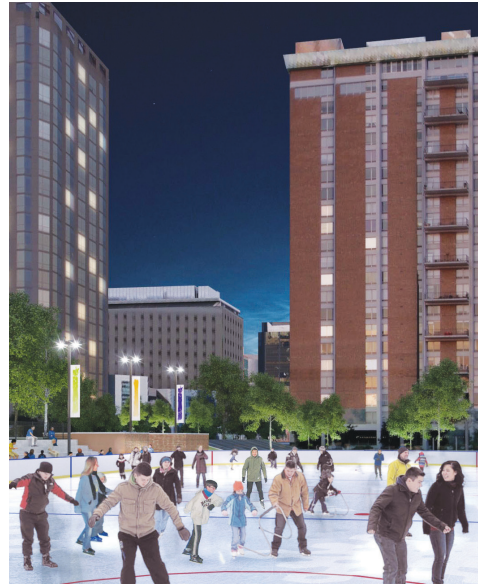
Rendering of Shaw Park Ice Rink Improvements

The design phase is now beginning for the new multi-use facility that will replace Shaw Park Ice Rink. The aging facility has served the city for the past 57 years, well beyond the life expectancy of the motors and concrete slab that form the ice all winter long. The building itself has been retrofitted numerous times over the years