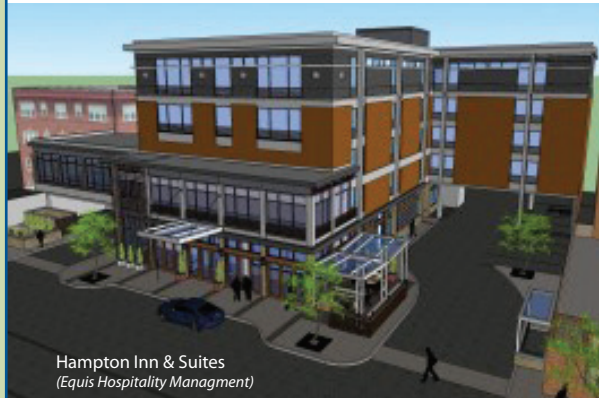
Hampton Inn & Suites (Equis Hospitality Management)

Work on the renovation of the property at 216 North Meramec Avenue is underway. The site of the former Daniele Hotel, which closed in 2007, will become a Hampton Inn & Suites. According to the developer, the 63,195 square foot building (including the addition of a fifth floor) will consist of 106 rooms, 25 suites, a 2,485 square foot public restaurant, and underground parking. The renovation will cost approximately $16M. Plans are to open the hotel this spring.