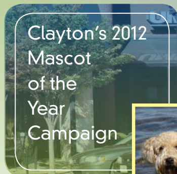
Corky 2011 Clayton Mascot

All That Glitters has become holiday tradition. The City of Clayton and Clayton Chamber of Commerce cosponsor this fun and free winter celebration that features family-friendly activities such as Skate with Frost at the Shaw Park Ice Rink with free admission, skates and snacks. Businesses along Carondelet Plaza invite guests to enjoy horse-drawn carriage rides, carolers and freshly roasted chestnuts. We suggest you find a good spot to view the fireworks display in Shaw Park at 8 p.m. For more information, call 314.802.7763.