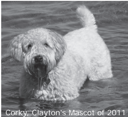
Corky, Clayton's Mascot of 2011

The Clayton Century Foundation (CCF), the non-profit organization supporting arts, parks, history and sustainability in Clayton, sponsored a new program, the Clayton Mascot of the Year campaign. The campaign presents an opportunity for proud Clayton pet owners to enter their pets in the running for Clayton's Mascot of the Year and generate funds (each vote costs $5) for the CCF.