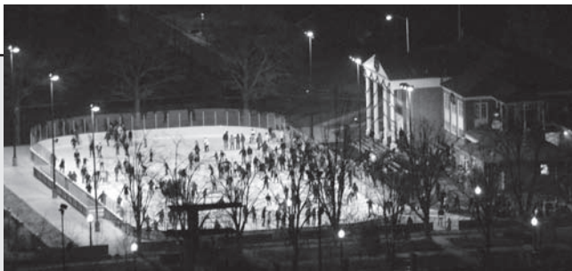
Shaw Park Ice Rink Season open through February 28, 2011

The 2011-2012 Mascot of the Year campaign will begin in October. Candidate registrations will be accepted in early November; voting will end in late November.