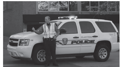
Safety cont'd. Page 4

Clayton's NEW website address: www.claytonmo.gov