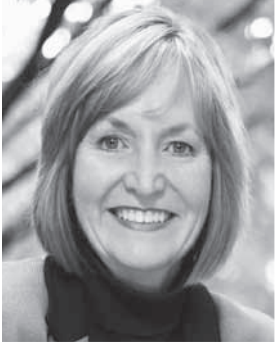
Mayor Linda Goldstein