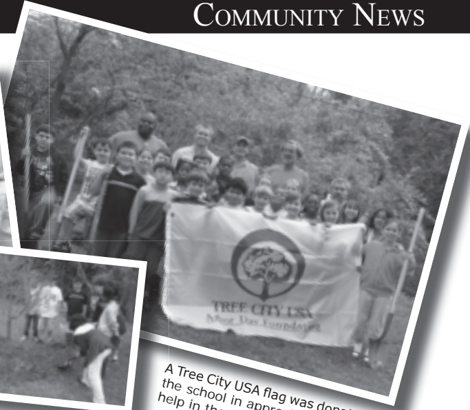
A Tree City USA flag was donated to the school in appreciation for their help in the Arbor Day Festivities.