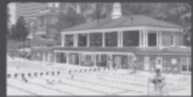
Shaw Park Aquatic Center