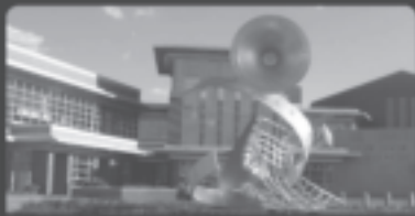
The Center of Clayton

Summer memberships are now available for all of Clayton Parks and Recreation's summer facilities. All guests must have an advantage card at the time of purchase to receive the resident rates listed below. For more information call 314-290-8500.