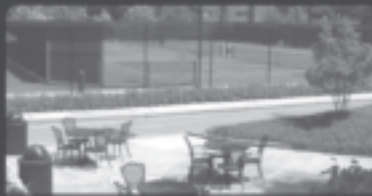
Shaw Park Tennis Center