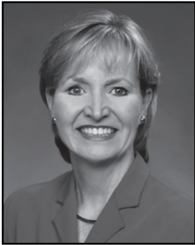
Mayor Linda Goldstein

The City of Clayton is known as an exceptional place to live, work and visit and for the maintenance of top quality work/life amenities. Making the community safer and physically more attractive is an integral part of this effort. To this end, the city included in its Fiscal Year 2009 Operating and Capital Improvement budget funds to continue work on the Pedestrian Safety Project to improve safety and the Streetscape Improvement Project to further enhance the city's reputation for setting high standards.