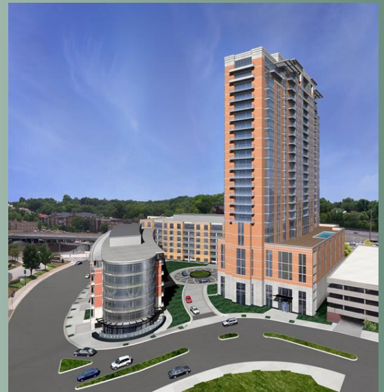
Rendering of the Orchard Development Group project looking southeast

For the second time in less than a year, the City has approved plans for another outstanding development to be built in its central business district. In December 2005, the Board of Aldermen approved the Centene Plaza redevelopment project designed for the block bounded by