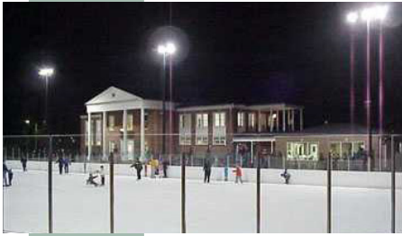
Shaw Park Ice Rink

The Shaw Park Ice Rink, Clayton's open-air skating, opened in 1960. The last major repairs were made in 1998. Since that time, the City has continued to make interim repairs in