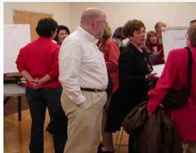
Lively discussions were held during breakout sessions at the Oct. 23 forum.

The study of the possible merger or combining one or more essential services of the Cities of Clayton and Richmond Heights has been deemed one of the most important issues either City faces currently, and public input an essential facet of that issue. To obtain the public's input, two public forums were conducted and residents from Clayton and Richmond Heights gave their comments and opinions.