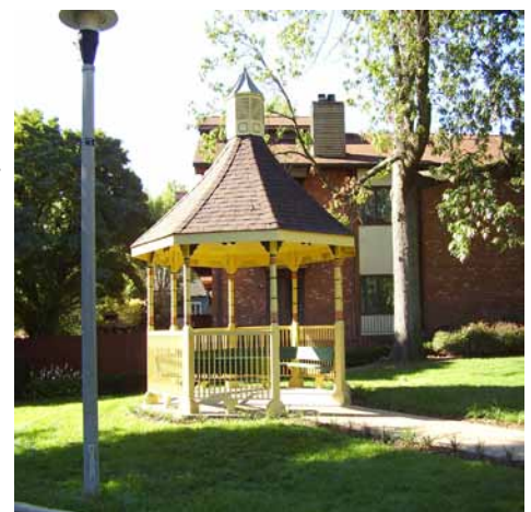
Refurbished gazebo in Taylor Park

He will be truly missed. The City is grateful for his contribution to the Department and to the safety of the citizens of Clayton. We wish him the best in his retirement.