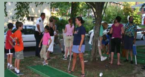
Activities in the Hillcrest Subdivision