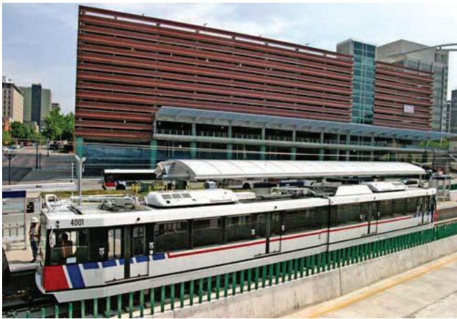
Shaw Park Drive Garage & Transit Center/ Clayton MetroBus Transfer Center

The Clayton passenger station with its walkway to the Shaw Park Drive Garage & Transit Center provides an added convenience for workers and visitors to Clayton. It also facilitates travel from Clayton to downtown St. Louis, Lambert Airport and other destinations throughout the Metropolitan area.