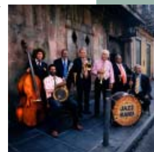
Preservation Hall Jazz Band