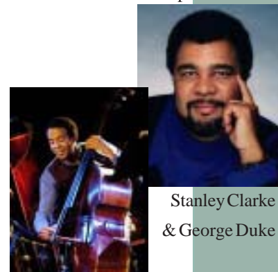
Stanley Clarke & George Duke