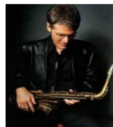
The David Sanborn Group