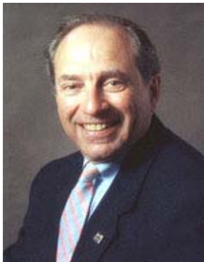
Mayor Ben Uchitelle

The City of Clayton is proud to announce that Mayor Ben Uchitelle was selected as one of the St. Louis Business Journal's group of St. Louis Influentials again in 2006. Mayor Uchitelle was recognized as one of the community leaders who is making a definite impact on the region. The Business Journal recognized Mayor Uchitelle for the impressive