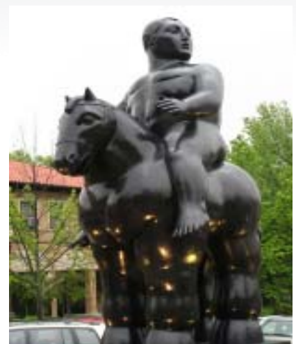
Man on a Horse by Fernando Botero

Two recent additions have reinforced Clayton's prominent position in the region's art community. On Thursday, April 28, a sculpture by world-renowned artist Fernando Botero was installed in the median at Hanley Road and Wydown Boulevard. The 11'6" bronze sculpture, Man on a Horse , is on long-term loan to the City from the Gateway Foundation, an organization that fosters and supports cultural and artistic activities and is devoted to improving the quality of life in the St. Louis metropolitan area. The Foundation acquired the sculpture and offered it to the City for its public art collection. Upon recommendation by the CAC, the City accepted the offer, and the Hanley-Wydown location was selected. The Foundation has covered the costs associated with the installation and maintenance of the artwork. Botero's work is represented in museum collections throughout the world and his monumental bronze sculptures have been exhibited along the Champs-Elysees in Paris, Park Avenue in New York, Paseo de Recoletos in Madrid, and Constitution Avenue in Washington, D.C.