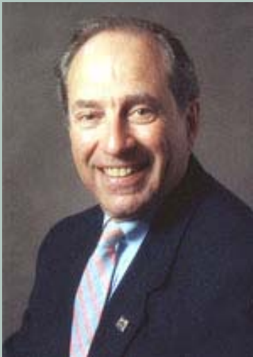
Mayor Ben Uchitelle