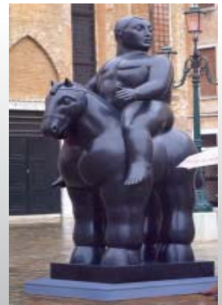
Fernando Botero's Man on a Horse